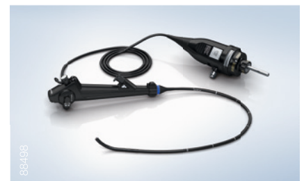
Olympus BF-H1200 bronchovideoscope

Olympus reserves the right of errors, modification and changes of the service and/or product offerings.