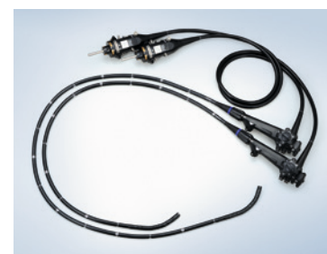
COLONOVIDEOSCOPE OLYMPUS CF-EZ1500DL/I

Specifications, design, and accessories are subject to change without any notice or obligation on the part of the manufacturer.